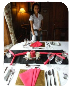
TABLE ART AND NAPKIN FOLDING